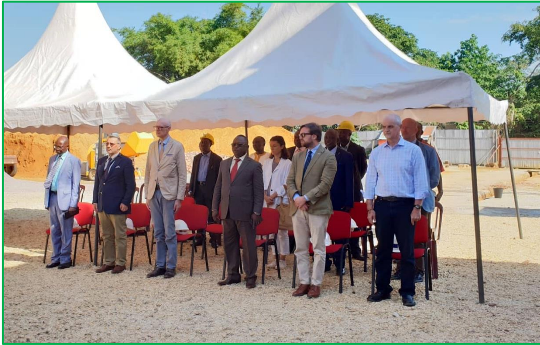
Fig. 3 – Officials attending the inauguration of building 6. From left to right: General Academic Secretary (UNIKIS), H.E. Ambassador of Portugal, H.E. Ambassador of European Union, Rector (UNIKIS), Chargé d’Affaires for the Embassy of Spain, Director General CIFOR.