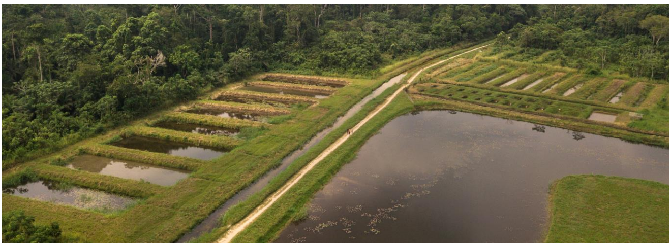
Fig. 4 – Integrated landscape management: the importance of protein intakes in relation to bushmeat issues including poaching (DRC).

R&SD pte Ltd successfully performed the final evaluation of Integrated Seed Sector Development (ISSD Project) in Burundi.