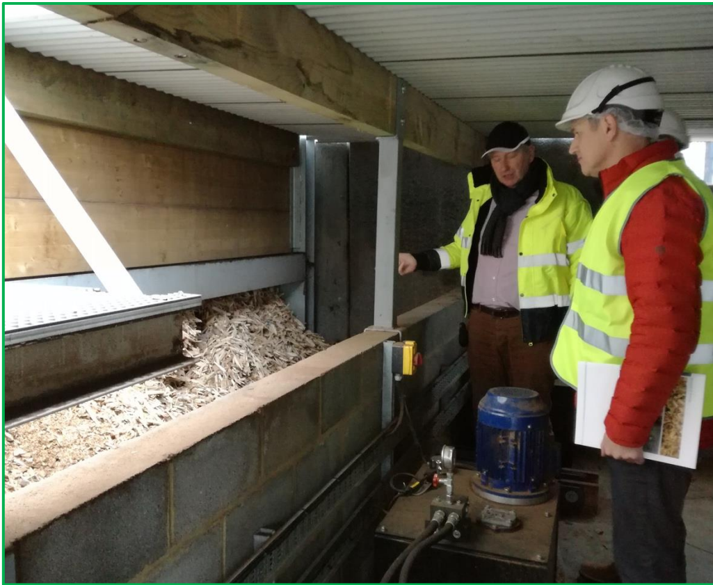
Fig. 5 – Vist of XyloWatt Combined CHP woody biomass facility in Mont-Godinne Hospital (Belgium).

R&SD is developing renewable energy solutions as part of integrated landscape management. Solutions tailored to African landscapes will enable local value adding and the creation of thousands of green jobs.