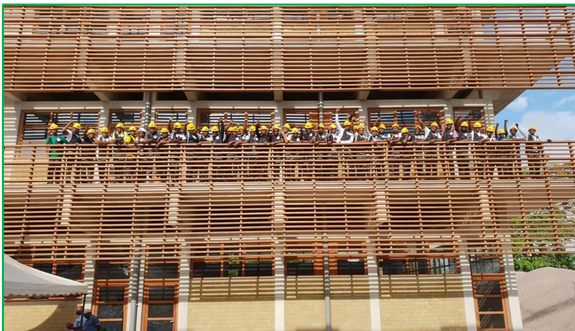
Fig. 2 – R&SD staff celebrating the end of work on building 6 (2,500 m 2 ).

The FORETS Project is implemented according to plan. Capacity building through education and research in forestry and climate change related matters has gained a strong momentum. The Faculty of Sciences and the Faculty of Management of Renewable Natural Resources are supported by the project. The campus will triple its capacity within the next four years.