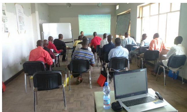
Fig. 2 – A class of Congolese agents attending a course on carbon finance (REFORCO Project).