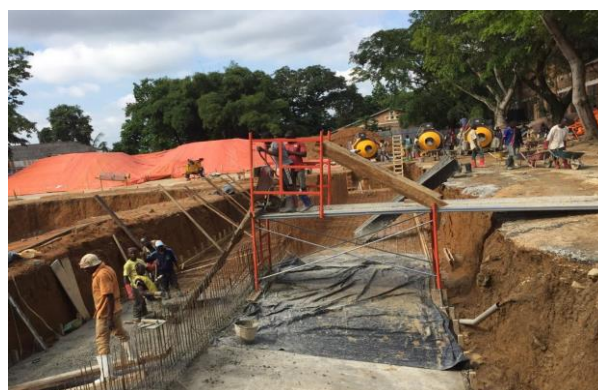
Fig. 3 – Construction of a 2500 m 2 building on the site of The Faculty of Sciences (University of Kisangani). R&SD strongly advocate an approach combining both resources efficiency and capacity building.

R&SD performed quality control services in the scope of research activities conducted by CIRAD 4 in Yoko forest reserve near Kisangani. On a request from CIRAD, R&SD translated the State of Forests (English-French and anglais-français) in order to get the document ready for the COP21 5 . We successfully helped the Delegation of the European Union in organizing two climate diplomacy days in Kinshasa (June and November 2015).