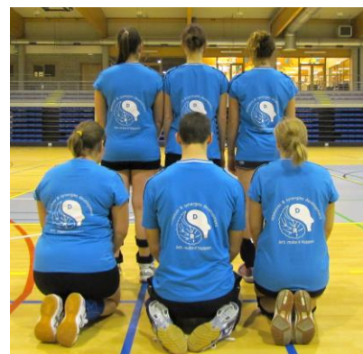
Fig. 18 – A corporate volley-ball team including one R&SD colleague has been sponsored by our company.

Thirty-seven staff members, five countries, three continents, one team.