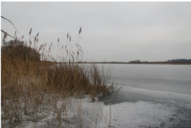
Fig. 10 – Latvia is 64.589 km 2 in area with a total population of circa 2 million. This Baltic country is blessed with beautiful landscapes, traditions and a lot of quiet space. It is the greenest country in the European Union (circa 50% of the country is covered with forests).