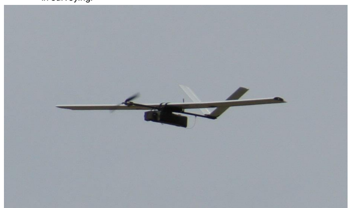
Fig. 9 – The UAV Falcon has a wing span of 240 cm, a length of 120 cm and a weight of 6 kg. It can safely operate between 100 m and 500 of altitude, at a cruising speed of 50 km/h. At present, the range of the Falcon powered with 4 lithium-batteries is up to 75 km.