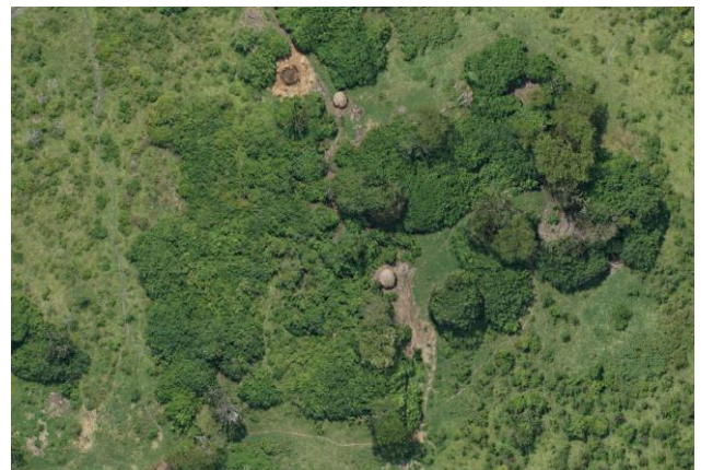
Fig. 7 – Very high resolution picture (5cm resolution orthophoto) can be obtained from data acquired from our UAV. This new technology fills a gap in surveying.