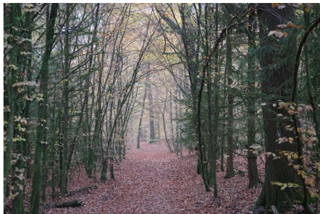
Fig. 15 – R&SD has undertaken a pilot project on fuelwood in Southern Belgium. We acquired 570 steres of fuelwood in order to develop and test innovative tree felling and skidding techniques.