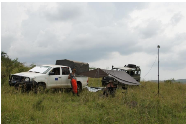
Fig. 6 – Our team operating a drone control station in North Kivu.

R&SD has an agreement with CLMAX Engineering, a start-up located in Denver, Colorado. His founder has developed one of the best light UAV 8 in the industry, the Falcon. R&SD has acquired one unit and GABT-ULg 9 has acquired one of them too. These drones have been used in DRC in order to monitor fauna, to acquire high resolution imagery, to monitor land use change and to assess biomass and carbon content. We have been providing the UAV builder with a lot of feedback on the hardware and software. Together we shall develop the Falcon II, a new UAV with enhanced capabilities, including greater range, heavier payload, etc.