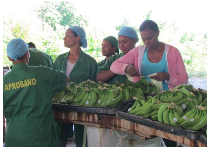
Fig. 5 – Women working in a banana packaging station in the Dominican Republic.