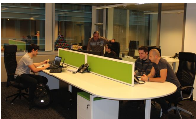
Fig. 12 – R&SD Technology office and team. A trainee from Exia.CESI (MSc in computer sciences) working on the implementation of an IT continuous integration platform.