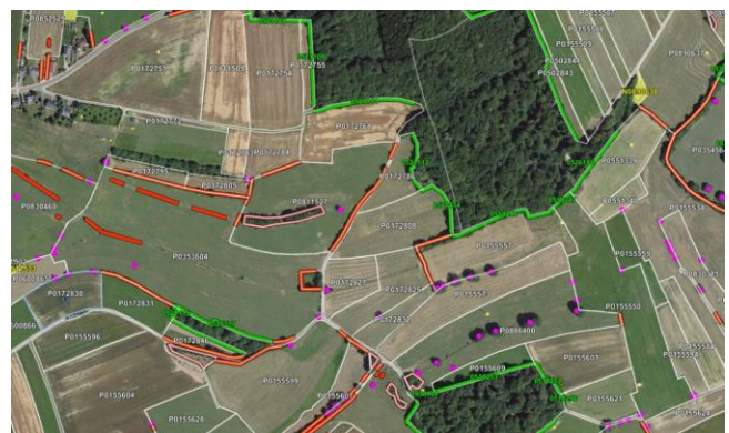
Fig. 13 – Map from Web-GIS solution for the management of agricultural parcels and landscape features in Luxembourg