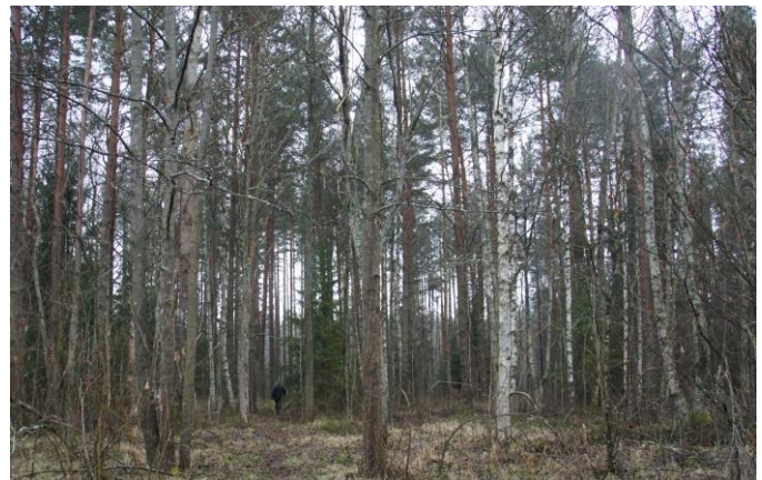
Fig. 11 – Forestry and agroforestry investments in Latvia provide opportunities not only for decent returns but also for environment-friendly activities.