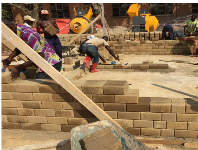
Fig. 6 – R&SD strongly advocate an approach combining both resources efficiency and capacity building. Workers were trained in new skills.