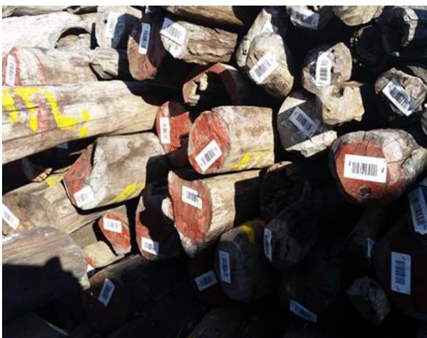
Fig. 9 – Seizure of illegal logs of rosewood. Rosewood is a very precious timber resource found in northern forests in Madagascar. It has been depleted for years. Several rosewood and ebony tree species are listed on CITES 8 annexes. The Government of Madagascar and the forestry administration are unable to efficiently fight this illegal trade of endangered species.

Dr Quentin Ducenne participated in an assignment led by The Food and Agriculture Organization (FAO) about governance in the forestry sector in Madagascar. This assignment was conducted in the scope of the FLEGT 6 programme in a non-VPA 7 country supported by the European Union.