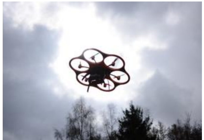
Fig. 3 – A civil drone used over rural areas in Luxemburg.