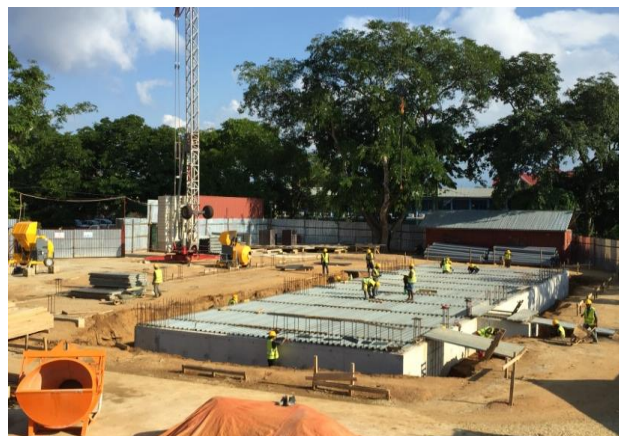
Fig. 5 – The foundation of the building also fits a 600 m 3 water tank. Earth excavated was used to build bricks (see picture 6).