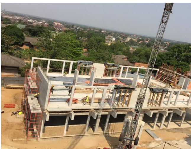
Fig. 7 – Early 2017 the building showed impressive progress.