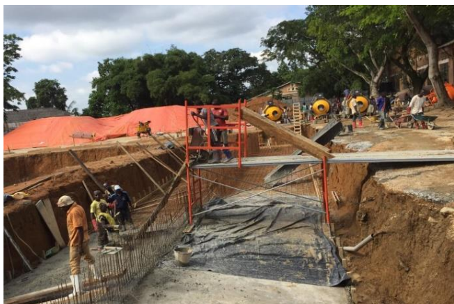
Fig. 4 – Construction of a 2500 m 2 building on the site of The Faculty of Sciences (University of Kisangani). Excavation work in 2015.