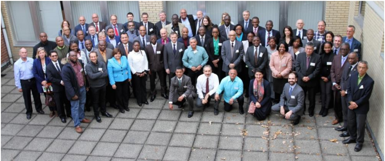
Fig. 8 – A 2-day workshop was held in December 2016 in Brussels. This event provided participants with a unique opportunity for sharing lessons and reviewing strategic orientations in the banana sector. The workshop was attended by some 80 participants, most of which representatives of producers associations, government agencies, donors, research institutions, etc.

R&SD has been partnering with Incatema for implementing the ‘Banana Accompanying Measures’, an initiative funded by the European Union. It aimed at supporting the banana sector in ten ACP countries 5 . Besides monitoring tasks, R&SD contributed to an important study on the level of competitiveness of the banana sector in these countries.