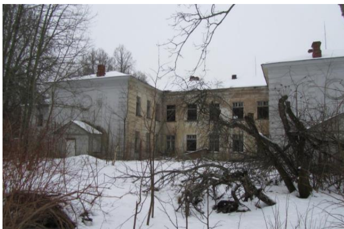
Fig. 11 – R&SD acquired an old school. This asset shall be maintained and improved. It will serve as a training center and welcome think tanks in 2020.