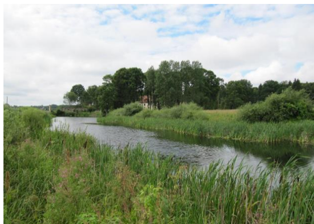
Fig. 12 – R&SD paid attention not only to assets such as buildings but also to landscapes and natural features.