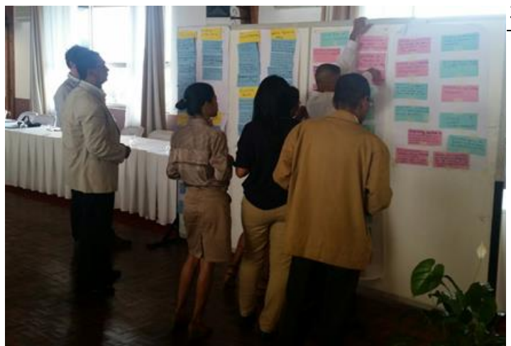
Fig. 10 – A Workshop was held in Antananarivo (Madagascar). Participants working in small groups identified priority interventions in the forestry sector with a special emphasis on governance.

Dr Ducenne also contributed to the development of a theory of change in the forest governance in Madagascar. The starting point is not very good in terms of governance. However, one must remember that there is no universal definition of “good governance”. Secondly, Madagascar is facing many challenges including poverty, law and order, deforestation and political instability to name a few. Under such adverse conditions, there is no silver bullet to address the governance problems facing poor farmers and weak administrations.