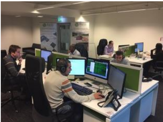
Fig. 2 – A team of experts in R&SD Technology offices.

A civil drone was used to acquire very high resolution imagery. Data acquired during this experimental flight were used to test new processing algorithms, in particular those related to automatic recognition of objects such as single trees, hedges, etc. present in rural landscapes.